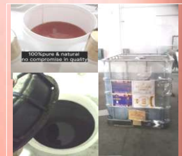
Our Previous Bulk Exports

🌿 My vision is to revive natural remedies in a modern, luxurious form, offering products that not only serve local customers but also reach and inspire people across international markets. 🌿